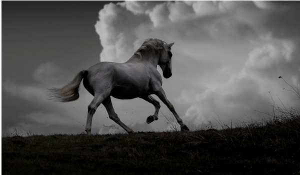
Heart Of A Cowgirl Photography

https://www.samanthadawnequinephoto.com/ Samantha@heartofacowgirlphotography.com